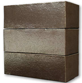
Urban Metal Bricks - Copper Lustre Splits by PGH Bricks