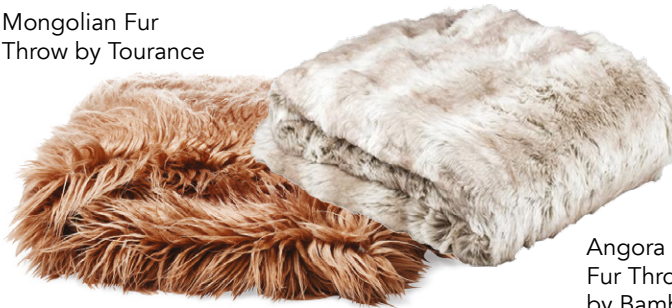
Angora Faux Fur Throw Rug by Bambury