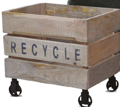
Storage Trolley by Loft Furniture & Other Ideas