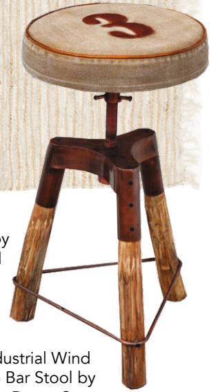
Industrial Wind Up Bar Stool by The Decor Store