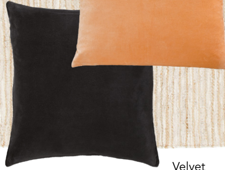
Velvet cushions by Castle and Things