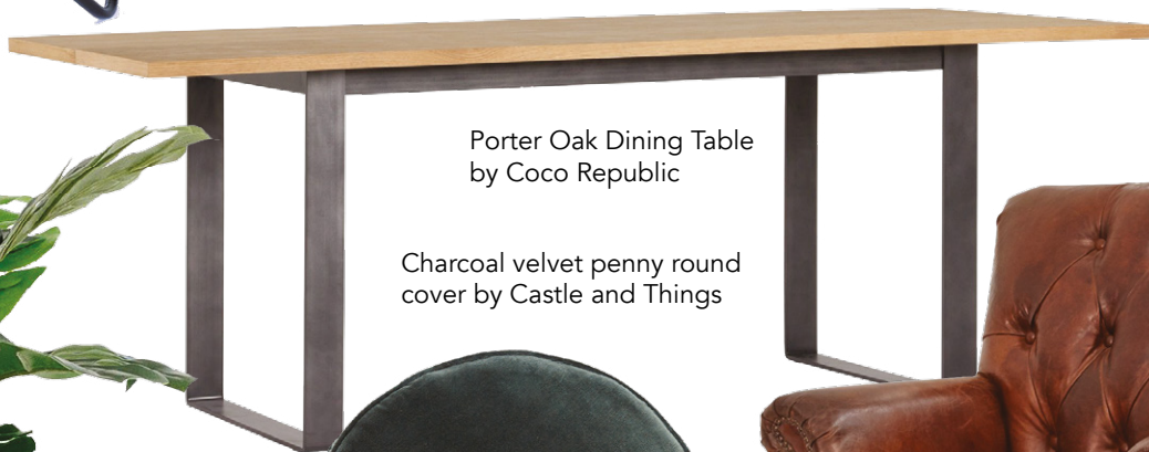
Porter Oak Dining Table by Coco Republic