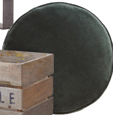
Charcoal velvet penny round cover by Castle and Things