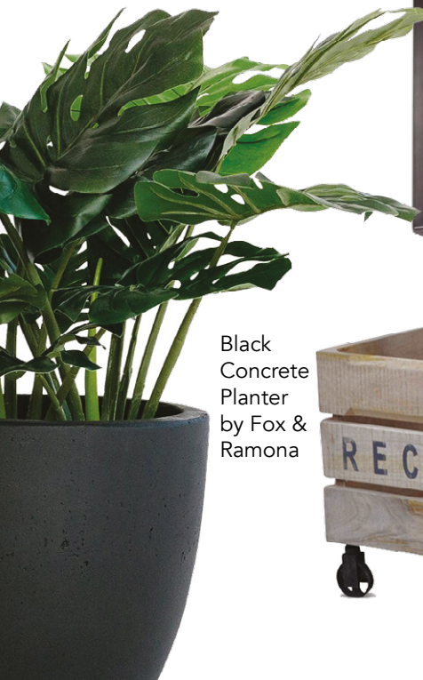
Black Concrete Planter by Fox & Ramona