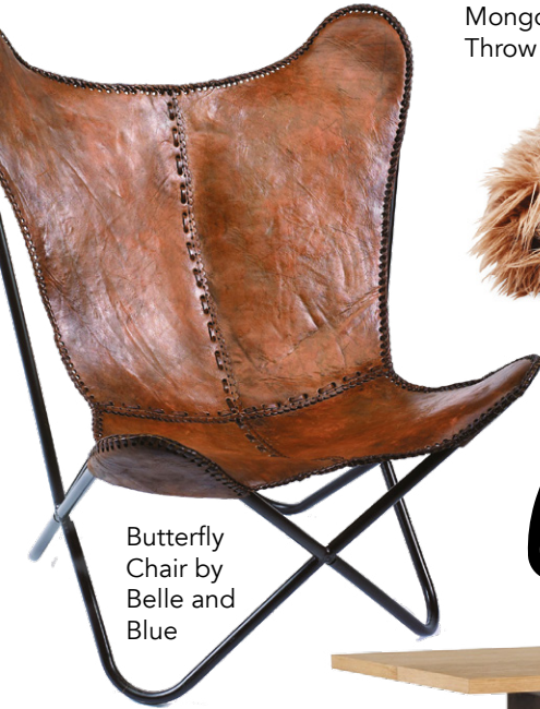
Butterfly Chair by Belle and Blue