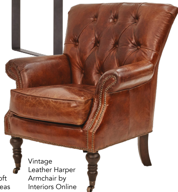
Vintage Leather Harper Armchair by Interiors Online