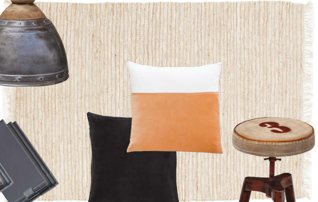
Bondi Leather and Jute White Rug by Network Rugs